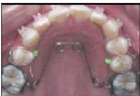
Fig. 4 Ligature wires tied to upper premolar bracket slots during Quad Helix delivery.