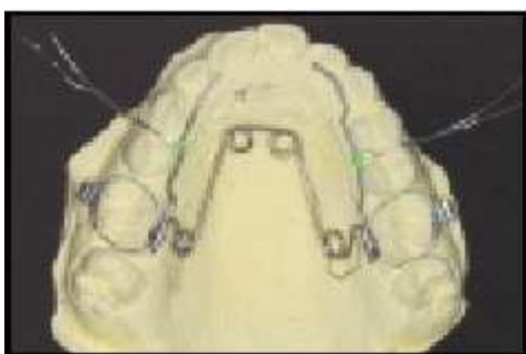
Fig. 3 Elastomeric modules with ligature wires slipped over anterior arms of Quad Helix.