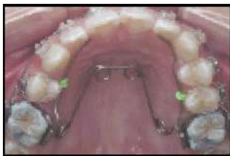
Fig. 5 .016" nickel titanium archwire placed for initial leveling.